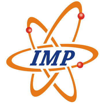
Visit to IMP Aug. 1997