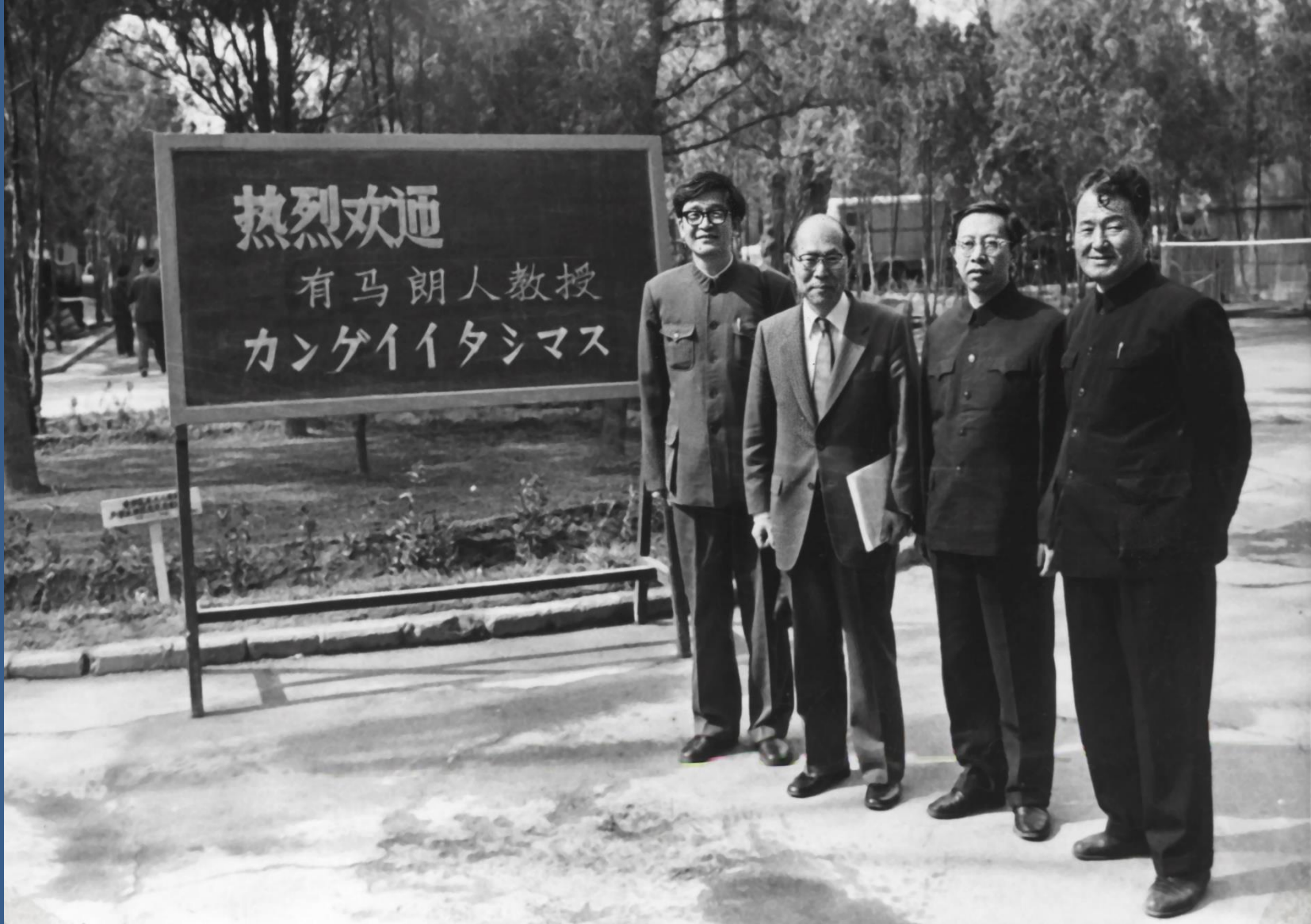
The First Visit to IMP, Apr. 1981